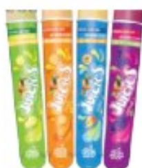
JUICY TUBE $1.50