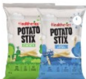
POTATO STIX $1.00