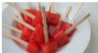
ICY CUBES - JUICE OR MILK 20c