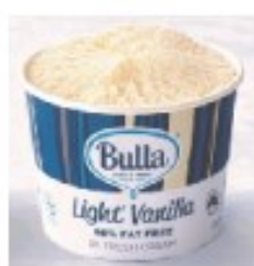
ICE CREAM CUP $1.20