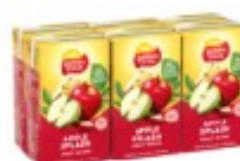
JUICE POPPER $1.50