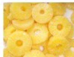
FROZEN PINEAPPLE SLICES 20c