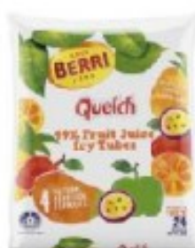
QUELCH STICK 70c