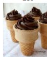
CHOCOLATE MOUSSE CONE $1.00