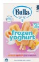
FROZEN YOGHURT ICEBLOCK $1.50