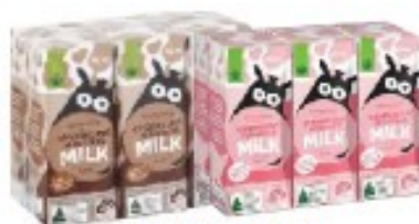
MILK POPPER $2.00