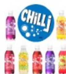
CHILL J DRINK $2.00