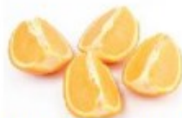
FROZEN ORANGE QUARTERS 20c