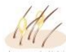
Louse eggs glued to hair shafts. Eggs are the size of a small pinhead

There has been a case of Head Lice in the school and we are asking all parents/caregivers to please check their children's hair and treat with the appropriate product.